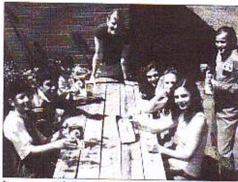
It tastes good, but we don't know if we would want to eat it everyday...

In order to enhance the NJ Core Curriculum Standards for Literacy and Science, students participated in 7th-Grade Space Day on May 17, 2007. Students explored space at the County College of Morris planetarium, ate a lunch of space food while listening to a speaker on that topic, and viewed the educational version of Apollo 13. Science classes also took part in the ever-popular "egg drop" competition, which asked students to design a protective chamber to experience some of the challenges NASA scientists do as they try to get astronauts safely back to Earth after a mission.