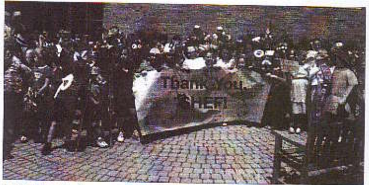
It feels good to be appreciated: The 2nd graders at Bedwell thanked SHEF for funding Insects in Flight .